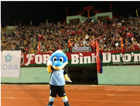
▲ TOKYU Binh Duong Garden City Cup 2013 (2013)

Từ 2018~2020 Organize visits to orphanages (in Da Nang and Binh Duong)