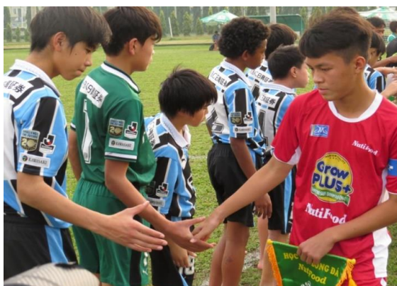
▲ KAWASAKI FRONTALE played in U-13 Cup in Vietnam (2017)