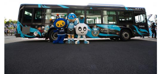
▲KAWASAKI FRONTALE Wrapping Bus

KAWASAKI FRONTALE Home Game is launched with the purpose of making the atmosphere in the areas more exciting. The first KAWASAKI FRONTALE Wrapping Bus was born from this campaign, and it’s operated as normal bus line, or airport coach, or just runs around Kawasaki even when no Home Game event takes place.