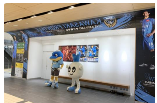
▲ Decoration at the waiting room inside the ticket gate at Musashi-Kosugi station (Photo from October 2019)

In addition, the waiting room inside the ticket gate at Musashi-Kosugi station is partly decorated with images of KAWASAKI FRONTALE’s players.