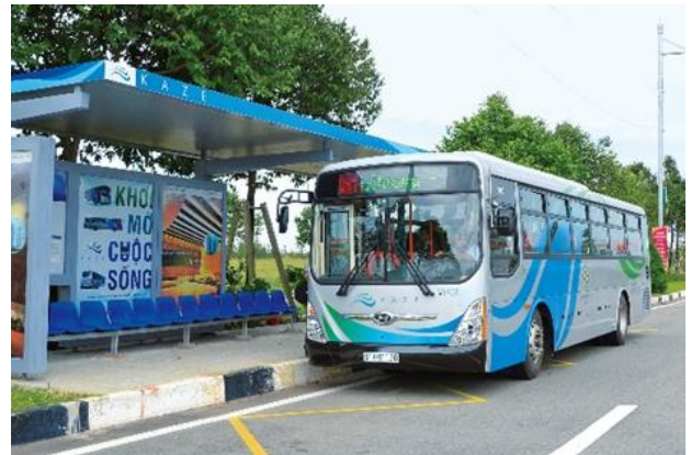
▲ The bus line KAZE SHUTTLE