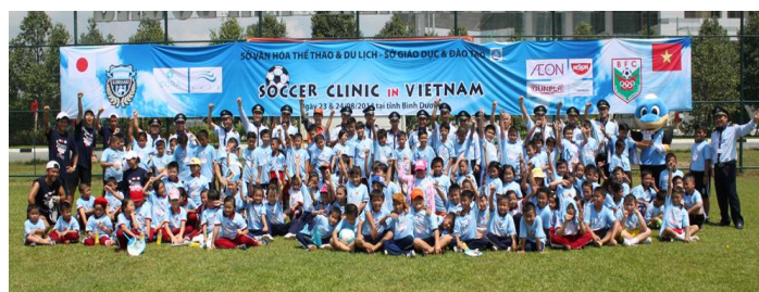
▲ KAWASAKI FRONTALE Football Clinic in Việt Nam (in 2014)

Detailed information is as the attachment.