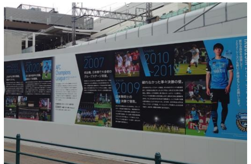
▲Kengo History Wall / 2021 Season Guide

Moreover, for the time being, KAWASAKI FRONTALE is also exhibiting the content of the 4 championships that the club participates in 2021.