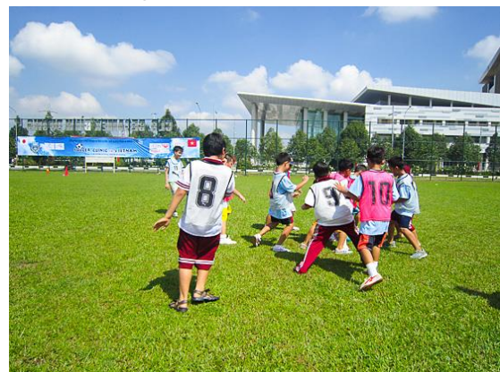
▲ KAWASAKI FRONTALE Football Clinic in Vietnam (2014)