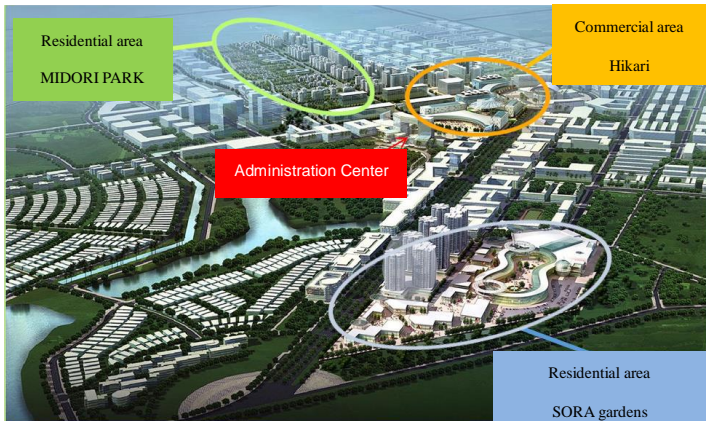
▲ Projects being developed in Binh Duong New City

Since 2012, TOKYU has been progressing the developments that include residential low-rise and high-rise housing projects or commercial facilities in Binh Duong New City (which total area is 1,000 ha). In 2014, a bus system was put into operation as a public transportation for Binh Duong New City.