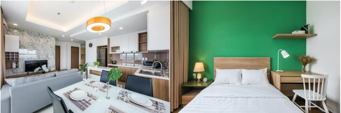
2-Bedroom Apartment (Left: living room. Right: dining room)