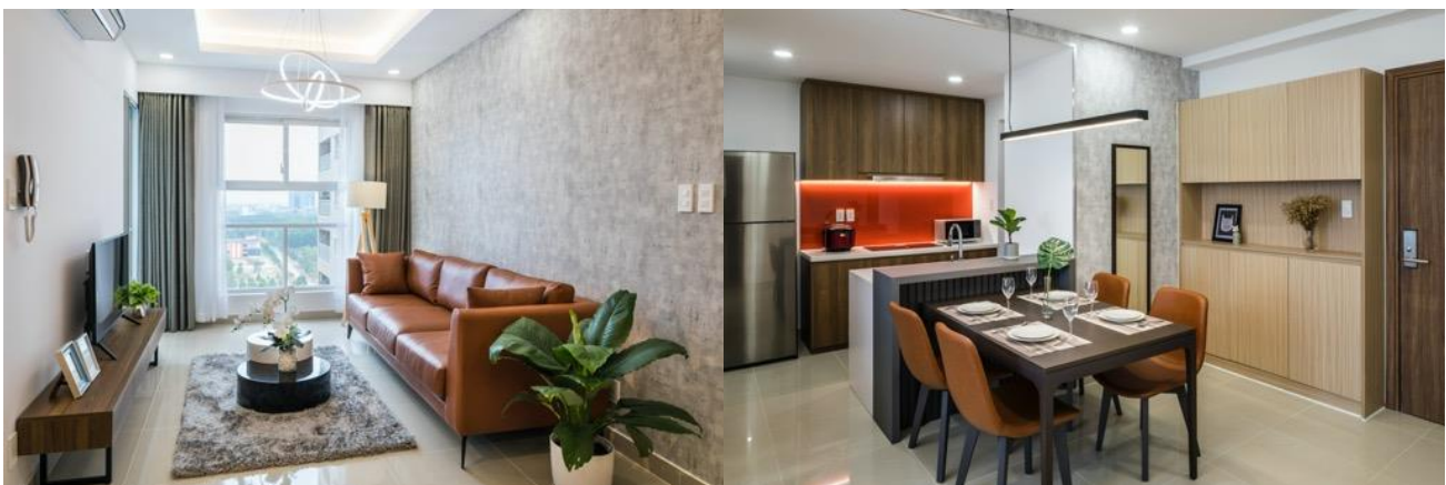
2-Bedroom Apartment (Left: living room. Right: dining room)