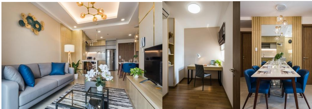
2-Bedroom Apartment (Left: living room. Middle: workroom. Right: dining room)