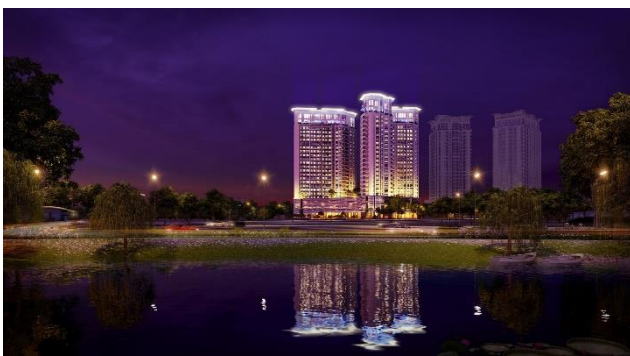
SORA gardens II Rendering