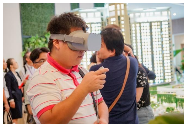
Customers experience the VR virtual system

< Any questions please contact: BECAMEX TOKYU CO., LTD >