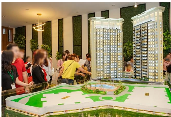
Photos of sales events

Overview of BTMJR Joint Venture and SORA gardens II as attached document.